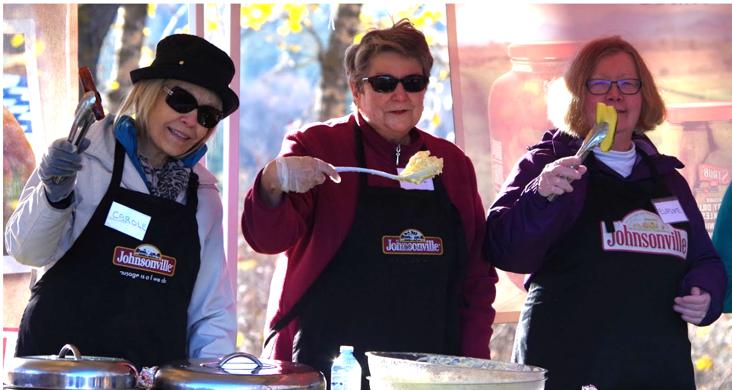
Members of the Edmonton Host Lions Club serve up food to hungry participants of Kathy's run on a cool October day in 2017