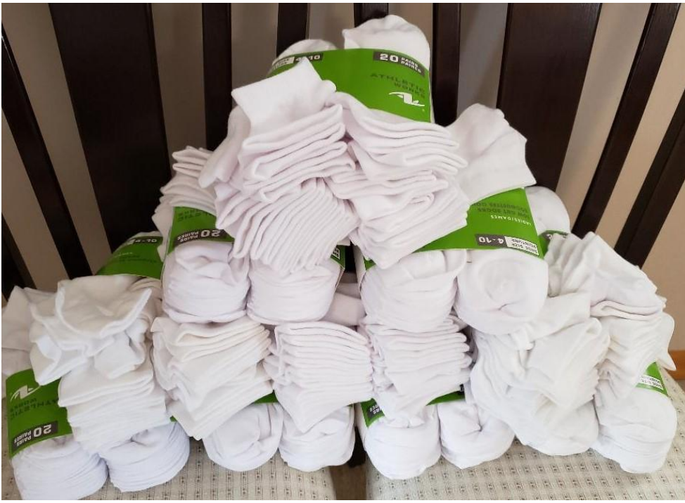
Photo of the partial donation made by Sock Rocket to the Edmonton Host Lions Club for use in the Lions Personal Care Kits